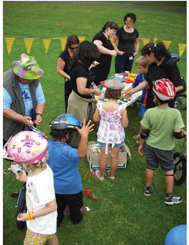
The decorating begins

As well as annual events the council promotes cycle safety and bike skills through its popular Better Bike programme in selected schools.