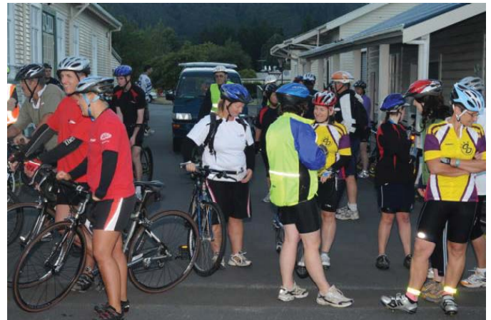
Helmets on and ready to go