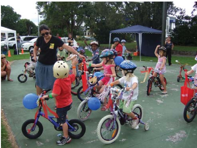
Children gather on their bikes

If you have a story you would like to share please email bikewise@nzta.govt.nz and someone will be in touch.