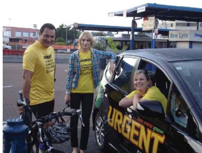
The TV3 news team