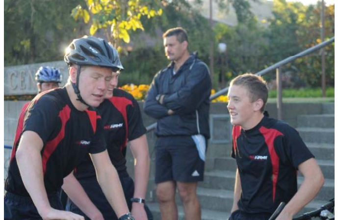
Cyclists get ready to start

This successful activity was very much a cross-unit, joint civilian/military organised event, and couldn't have happened without assistance from a variety of sources.